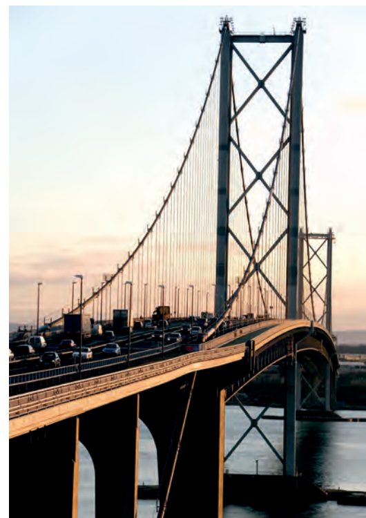
8power's device was tested on the Forth Road Bridge.