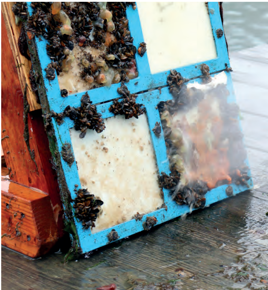
Specially developed paints help to deter marine fouling in field trials.

By placing large dampers at locations between concrete structures where the