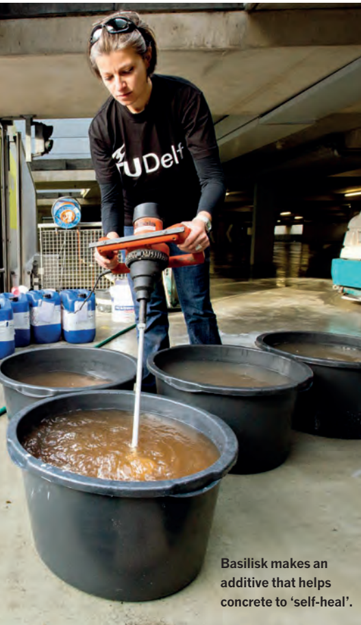
Basilisk makes an additive that helps concrete to 'self-heal'.

millimetre wide to be sealed. By including that proportion of mixture, “you double the price of the concrete mix,” Jonkers says. But he points out that the price of concrete is about 1% of the overall cost of building a bridge, and the additive should lead to savings in repair and maintenance.